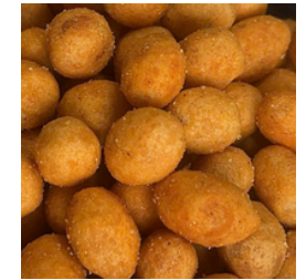
Roasted Peanut BBQ/ SEAFOOD