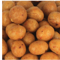
Roasted Peanut With Chilli Garlic