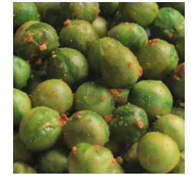
Roasted Greenpeas With Chilli Garlic