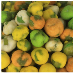
Roasted Greenpeas With Mixed Flavor