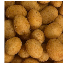
Roasted Peanut TOMYUM