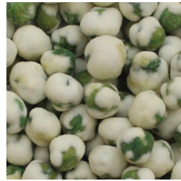
Roasted Greenpeas With Milk