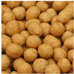
Roasted Peanuts With Coconut Juice