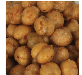
Roasted Chickenpeas With Chilli Garlic