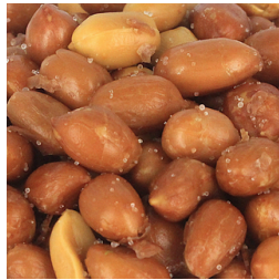
Roasted Peanut With Salt