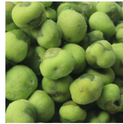
Roasted Greenpeas With Wasabi