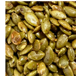
Roasted Green Pumpkin With Chilli Garlic