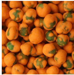
Roasted Greenpeas With Durian