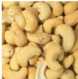
Roasted Cashew With Salt