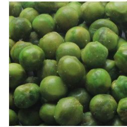
Roasted Greenpeas With Salt