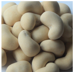
Roasted Cashew With Coconut Juice