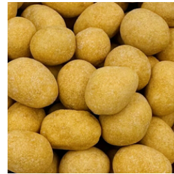
Roasted Peanut With Cheese